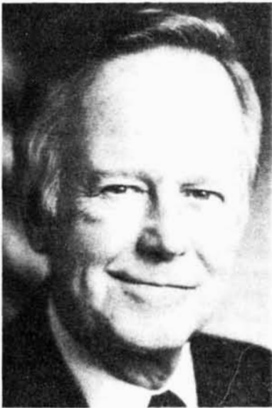
Brock ADAMS Democrat

We have a lot to be proud of in Washington State. But we need new leadership and long-range vision to help us reach our full potential. I grew up here and I understand how important it is for our Senators to fight for us. It's what we in Washington expect. I have always fought for Washington State.