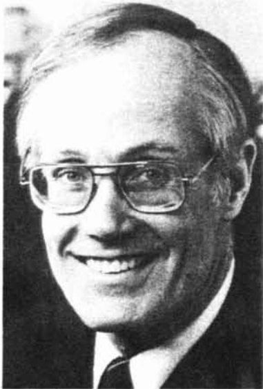
Slade GORTON Republican

Only a handful of men and women in Washington State history have devoted as much of their lives to public service as has Slade Gorton.